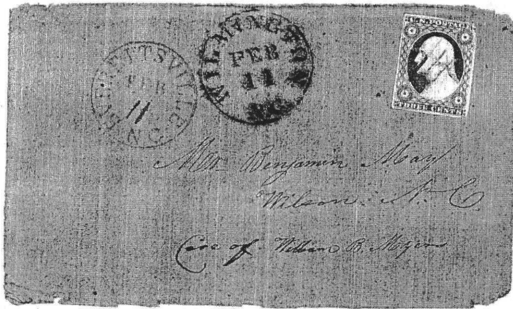
Everettsville Post Mark [on left]

Addressee: Benjamin May, Wilson Item Date: 2/11/185x Origin PO: Everettsville Origin County: Wayne Cover Type: Envelope Postmark Type: 2 Postmark Color: Red Notes: Also Wilmington Type 8 (black) Source of Record: Postal History Collection Call Number: Postal History 2564 Item #: