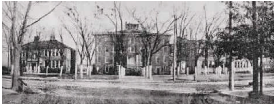
William Street School