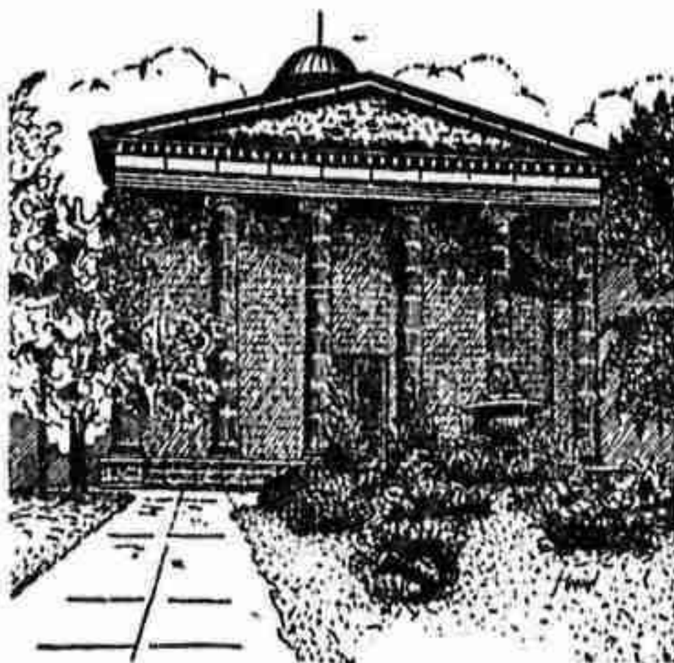
Old State House FRANKFORT, KENTUCKY