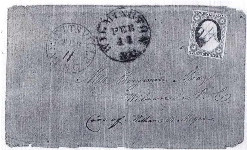
Everettsville Post Mark [on left]